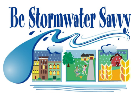
Don't let a good drop go bad!

Johns Creek Stormwater Utility Presentation link